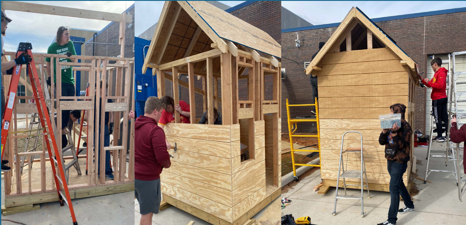
Pictured here: Construction Science students building Liberty High School's 2022 playhouse for the Parade of Playhouses.

As Liberty High School introduces more trade-related technical education into the traditional high school shop class model, they are often working from a deficit in regard to materials, tools and overall budget. The high school's annual operating budget barely covers materials for our traditional curriculum leaving no money for tools and materials associated with additional projects, such as its newly founded Construction Science Club and building a playhouse for the KCHBA's Parade of Playhouses. This grant will purchase jobsite tools, storage and safety equipment as well as other learning aides to introduce and excite students about careers in construction.